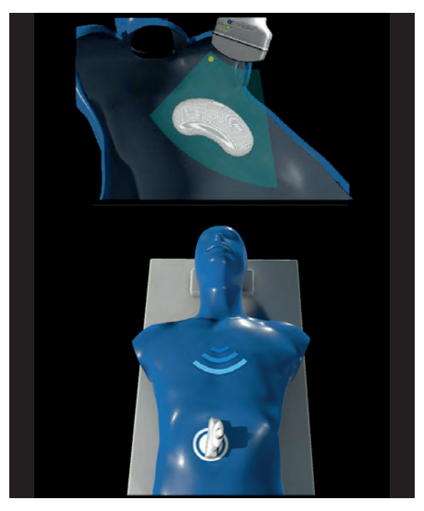
Learn how the probe interacts with the 3d shape