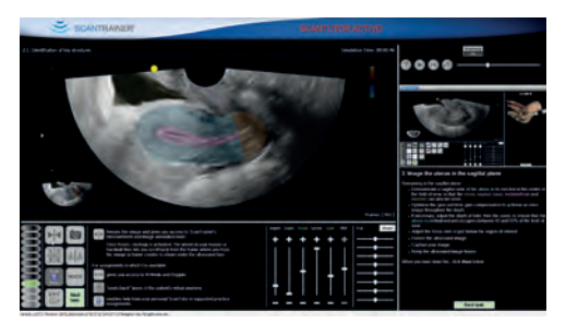
Real-time on screen visual guidance helps the trainee to orientate the probe, identify structures and make measurements.

"It's like learning with a real expert and it's available 24/7!"