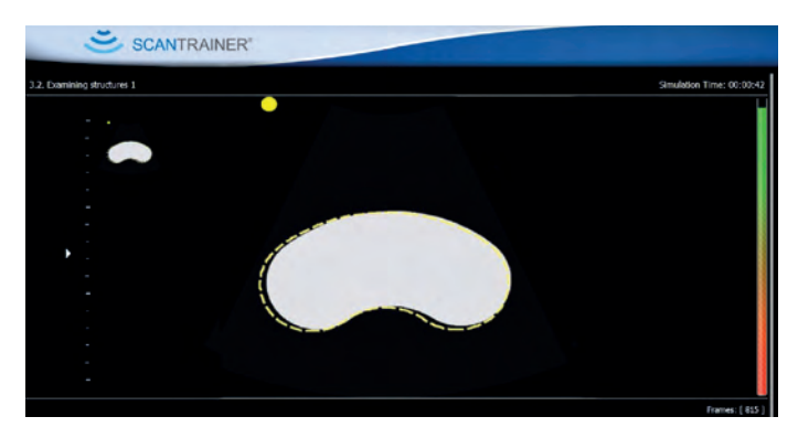
Guide the ultrasound image with the probe to match the on-screen shapes

Our ScanTrainer Probe Manipulation Module enables Trainees to practice and perfect the subtle transducer movements required to capture quality images and examine complex structures.