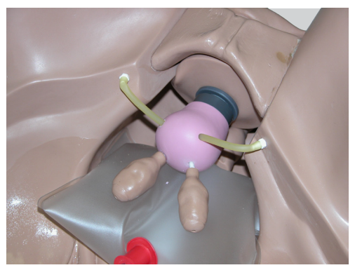
Figure 3. Opaque, Normal Anteverted Uterus with Shortened Round Ligaments

All the rubber tubing is interchangeable.