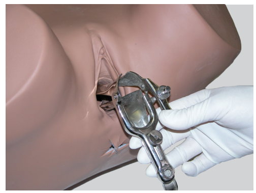
Figure 5. Inserting a Bivalve Speculum

To view the cervix (Figure 5), insert the closed blades of the speculum in the vertical position while angling them posteriorly. When the speculum is fully inserted, rotate the blades 90° (degrees) and gently open them fully. To increase the diameter of the opening, use the thumb screw.