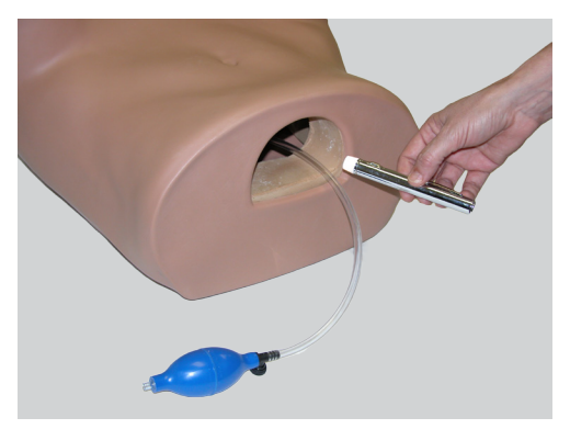
Figure 1b. Opposite End with View Port

The "view port" may be used to look into the pelvis to see the simulated uterus, tubes, ovaries and other pelvic structures. In addition, the instructor can insert her/his hand through the port to determine what the trainee is actually feeling (i.e., palpating the uterus or locating an ovary) on bimanual examination.