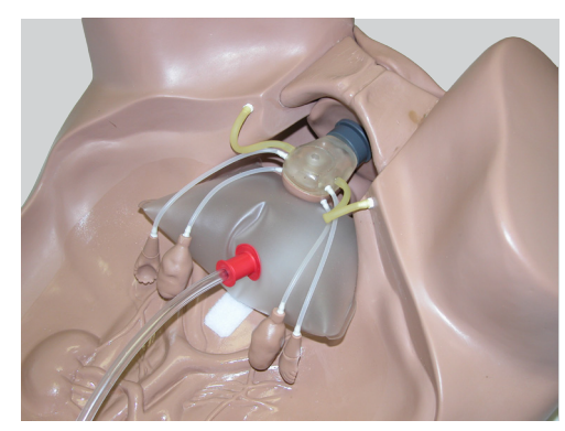
Figure 2. Translucent, Normal and Anteverted Uterus, with Tubes Ovaries and Round Ligaments

By inflating the air bag, the body of the uterus can be elevated making palpating it easier for first time learners. In addition, to make palpation of the uterus even easier, the round ligaments can be shortened (Figure 3).