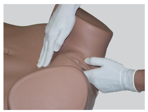
Figure 7. Performing a Bimanual Examination

Do not palpate using fingernails as doing this may tear the abdominal skin of the simulator.